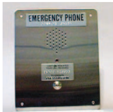
Model VRT-1500 Flush Mount