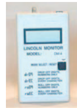
Model DM-4 Display Monitor