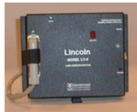
Model LC-8 Line Concentrator