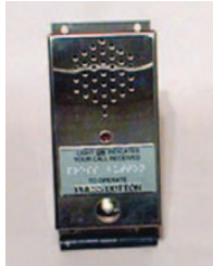
Model VRT-1000 Surface Mount